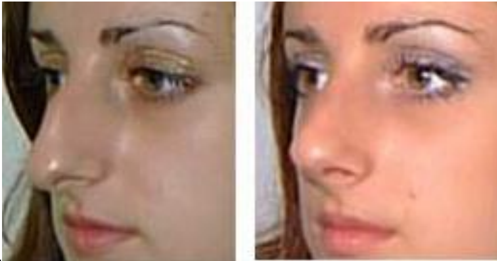
Figure 3: A. Before. Ethnic long and aquiline nose, disrupting the correct facial proportions. Short upper lip, with incorrect 3:1 proportion of the lower face. B. After. Rhinoplasty, including humpectomy, digital fracture vs lateral osteotomy, T-excision for tip rotation and 3 mm excision of the prominent posterior septal angle and nasal spine. The result is correct aesthetic proportions of the face and lower third of the face. The photo is taken in the operation theatre, immediately after ambulatory closed rhinoplasty - atraumatic, mini-invasive, bloodless. The result is beautification.

A. Figure 4: A. Before. Ethnic long and aquiline nose disrupting the correct facial proportions. No self-confidence, uncertain appearance. Short upper lip. B. After. Rhinoplasty, including humpectomy, digital fracture vs lateral osteotomy, T-excision for tip rotation and 3 mm excision of the prominent posterior septal angle and nasal spine to improve the lower third of the face. The result is beautification and improved self-confidence.